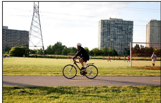
Example of a multi-use trail